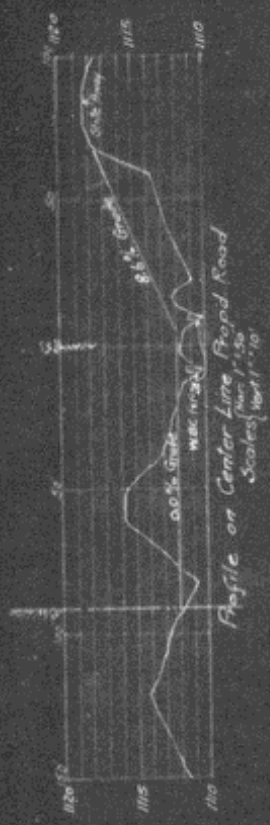
Profile on Center Line Prop'd Road Scale 1"=100'

Prop'd. Work shown Red Valuation Section 2 of Minnesota.